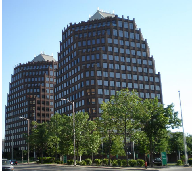
AMERICAN CENTURY TOWERS