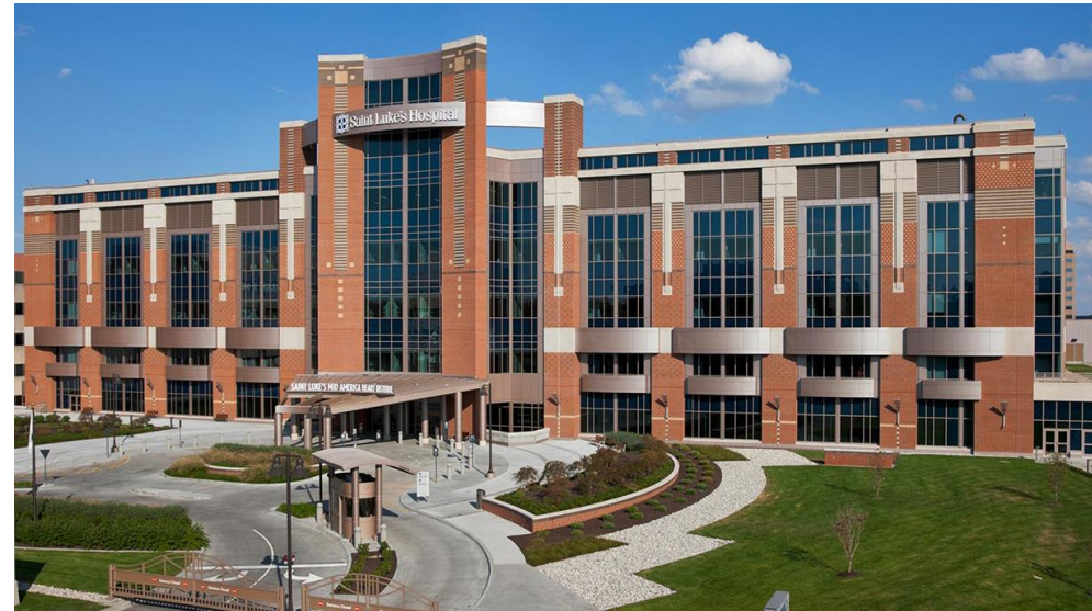
ST LUKE'S HOSPITAL OF KC