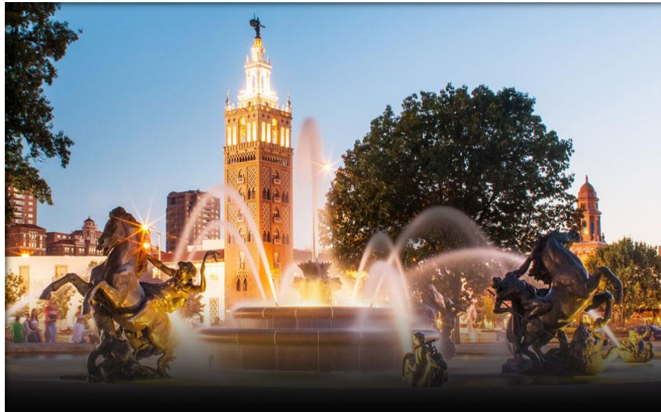
COUNTRY CLUB PLAZA