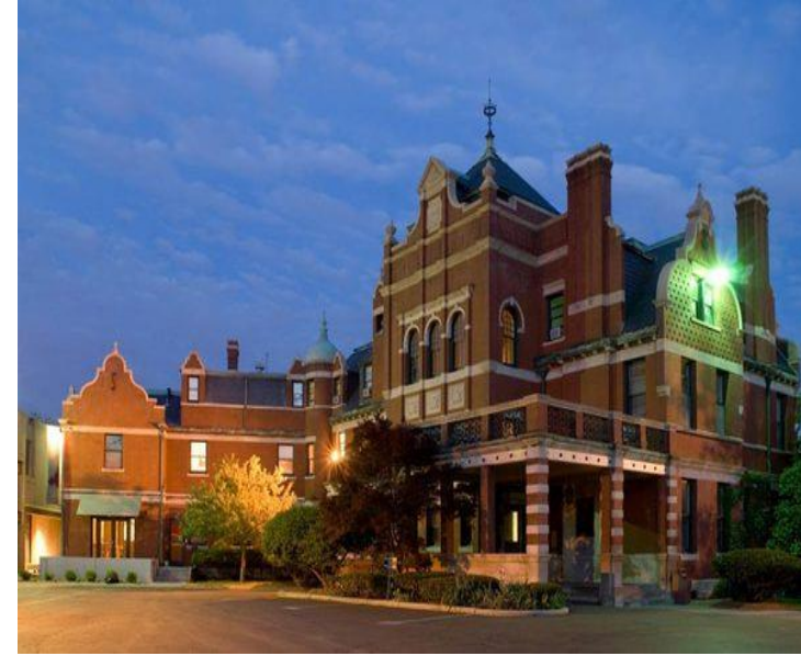
KANSAS CITY ART INSTITUTE