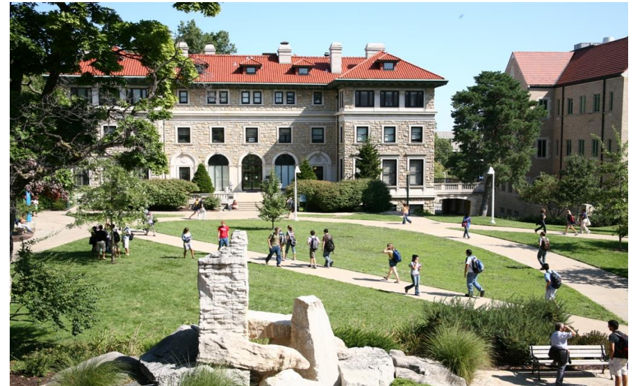
UNIVERSITY OF MISSOURI-KANSAS CITY